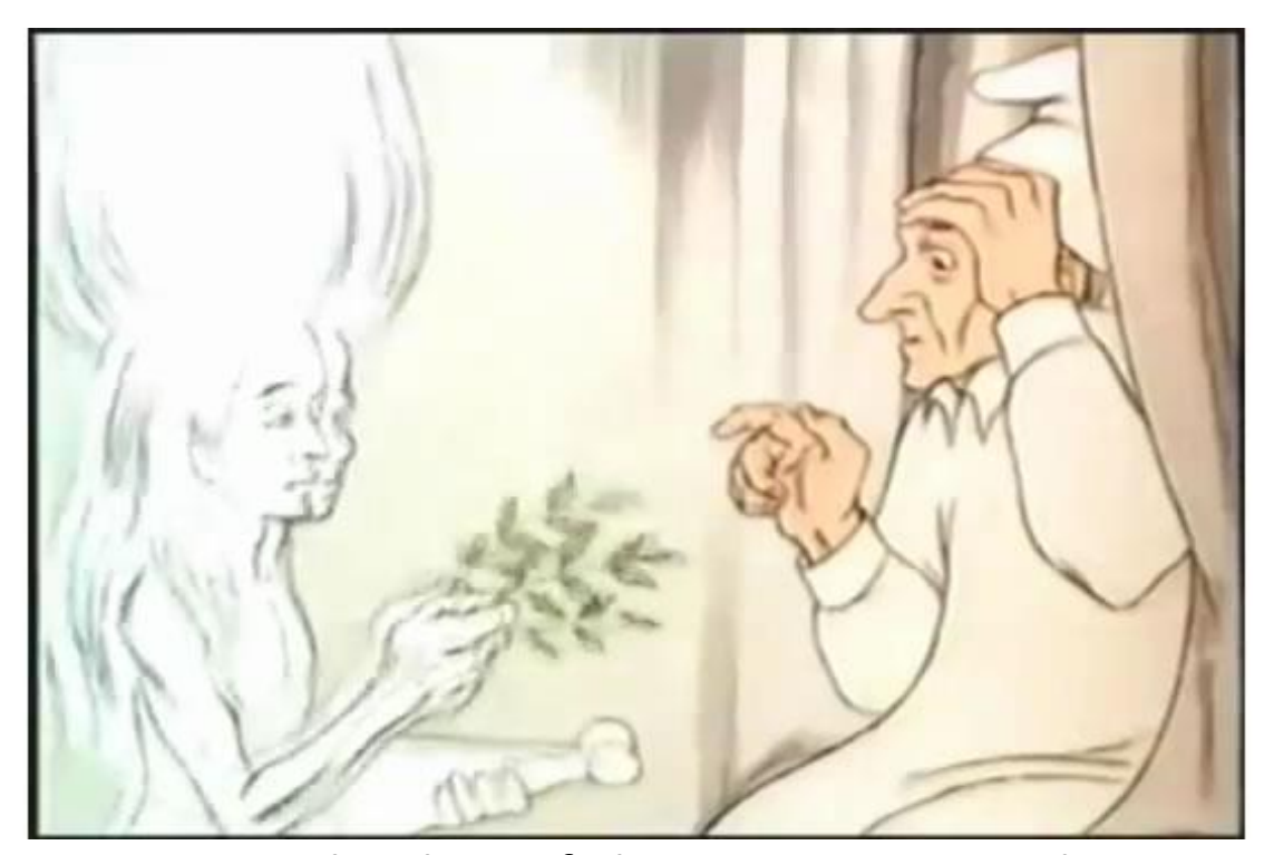
Soon the ghost of Christmas past arrived.